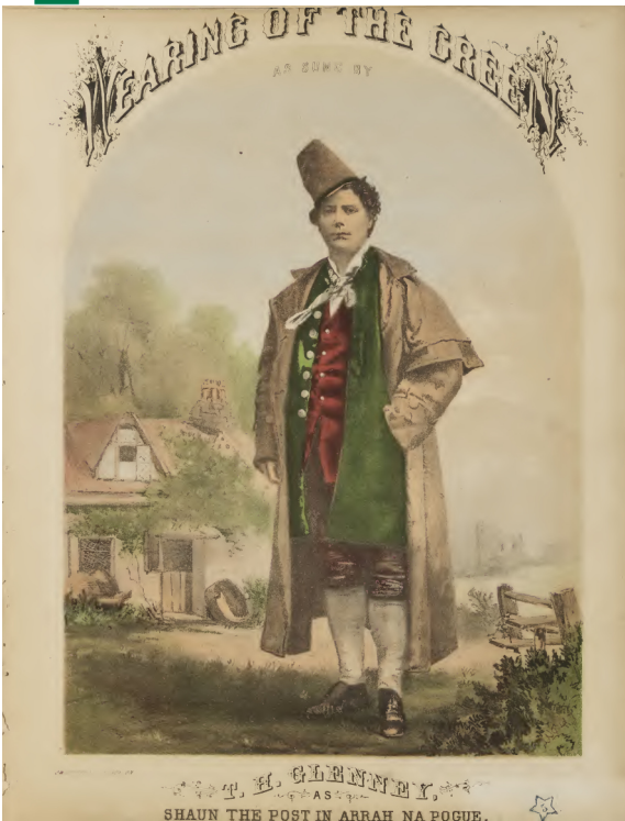
Cover of one of the first printings of Dion Boucicault's song circa 1865

Stephen Watt quotes Boucicault as saying: